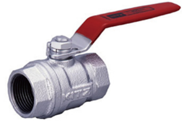
Fig : STZ

: DUCTILE IRON, STEM MATERIAL : BRASS, BALL MATERIAL : FORGED BRASS, KITZ